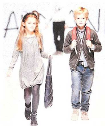
FASHION FOR ALL Clockwise from left: A fall 2011 look from Thierry Mugler (a brand arriving at Oxygene this season); the interior at the current boutique (soon to move); autumn looks from Armani Junior