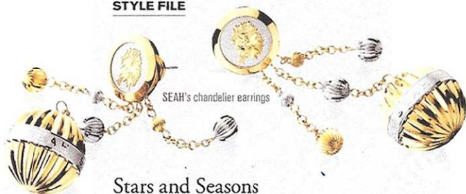
SEAH's chandelier earrings